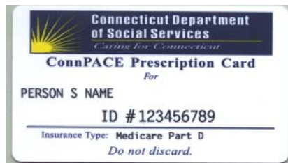
New ConnPACE ID Card (front)